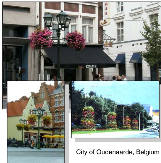
City of Oudenaarde, Belgium